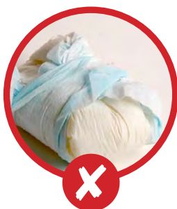
Nappies (Belong in the waste bin)