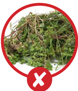
Green waste (Belongs in the waste bin)