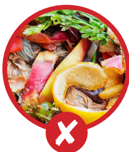
Food scraps (Belong in the waste bin)