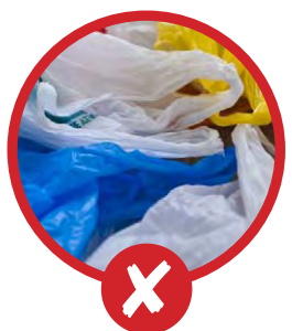
Soft (scrunchable) Plastics (Belong in the waste bin)