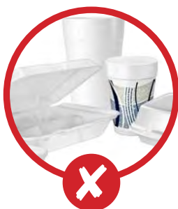
Polystyrene (Belongs in the waste bin)