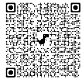
'The Manual' Book

... often witnesses to mass shootings report that men instinctively shield their wives or girlfriends with their own bodies. Put like that, most husbands would like to think, "Yes, I'd take a bullet for her". Quick, spontaneous, heroic-and almost inevitably a fantasy. Reality? You'd take a bullet for her, great, but will you do the dishes for her? Or visit your mother-in-law with her? And I mean happily visit her mum. That's much tougher. It's not quick, spontaneous or a fantasy. It's real. But you know what? In its own way, it's heroic. Married life is a thousand small decisions to put her first-to take the initiative to do what is best for her. Or, to put it in really simple, mundane terms, to be unselfish.