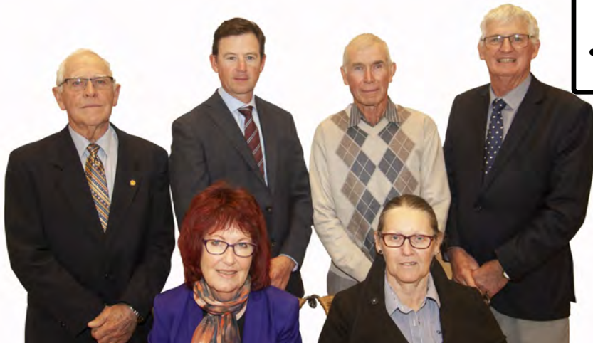
Shire of Wandering Elected Members